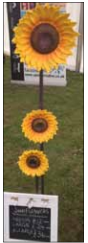
8th B&D Entry?